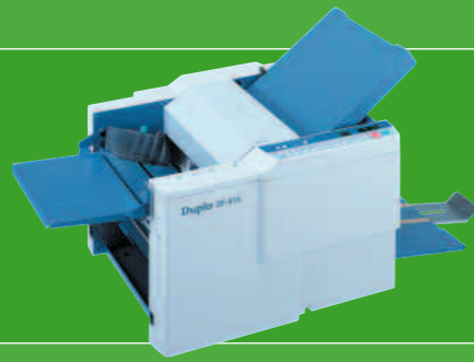
Automatic Folder DF-915